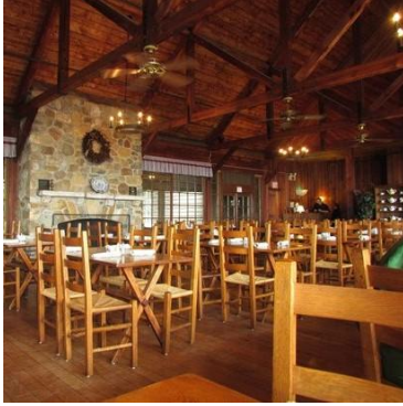
Big Meadows Lodge