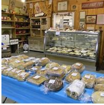
Buckland Farm Market