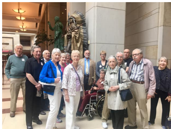
From our Facebook page " DC Waterfront Village :" Waterfront Village members enjoy an Historians Tour of the U.S. Capitol on May 8.